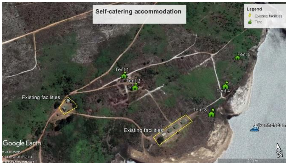
Figure 1. Overview of the accommodation

As an accredited training provider CEG also intends to host training and team building interventions and workshops utilizing the same facilities. The venue provides an excellent location for practical conservation activities that could include alien clearing, fire protection amongst other activities that might bear some benefits for DAFF as well.