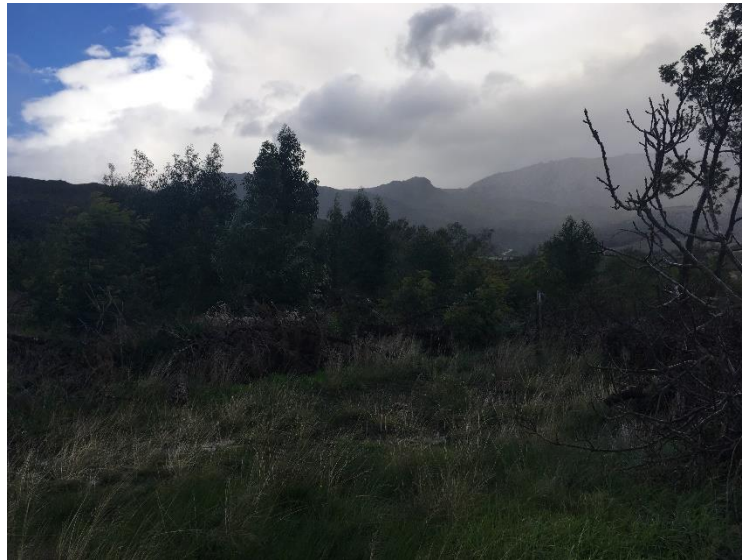
Figure 1: Invasive plants species growing near the cottages

The area is currently a huge fire risk due to the high infestation of alien invasive species that are growing on site. The spread of invasive alien plant species is rapidly taking over the entire site which in itself is posing a huge risk for DAFF.