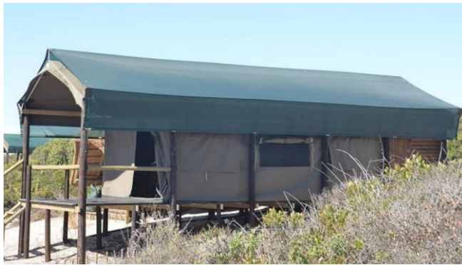
Figure 2: Example of tents to be installed

We also intend to utilize the areas with green building icons to erect and establish 5 tented camps to offer a variety of accommodation options in the area. The development of the tents would be on the disturbed area therefore will have no impact to the environment. Two tents would be erected on the existing foundations of house the burnt a few years ago.